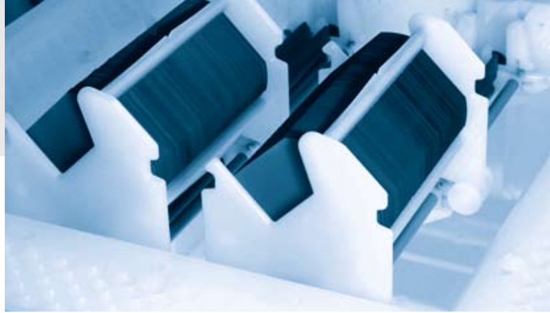
DC Carrier processing