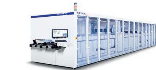
RENA Batch platform

Supplying good equipment only takes you half way to customer satisfaction. We maintain our partnership with our customers thanks to customer proximity at ten service locations around the world, good availability, qualified staff and a rapid spare parts service. Whenever necessary, we install upgrades or even customized modifications on-site.