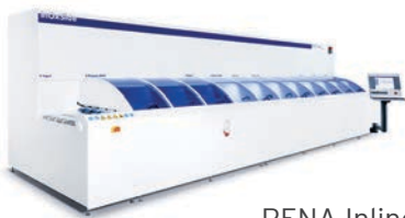
RENA Inline platform